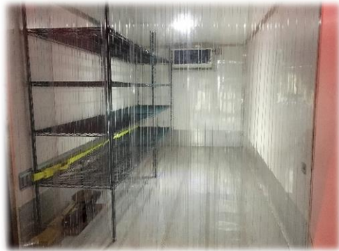
Optional Shelving Available

Website: Iceboxtogo.com , Voice/Text – 814-329-0408