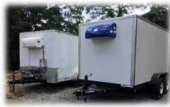
Neat and Clean Appearance

Parties, Weddings, Pig Roasts, Promotional Events, Caterers, Restaurants, Fairs and Festivals, Hunting Camps, Florists